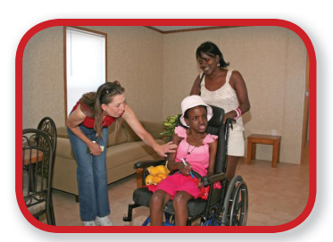
Responder assisting child and mother