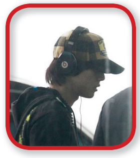
Teenager with headphones