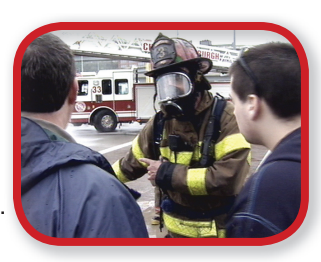
First responder pointing direction to safety