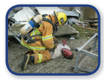
First responder providing assistance after warehouse collapse