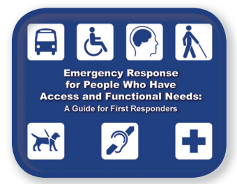
Flip book cover