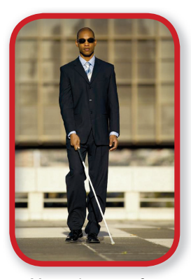
Man using cane for person who is blind