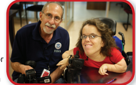
Responder sits down to assist young lady