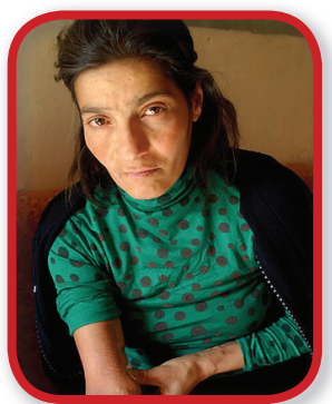
Woman with medical needs