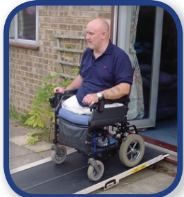
Man using motorized wheelchair and access ramp