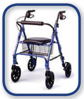
Walker with hand breaks and basket