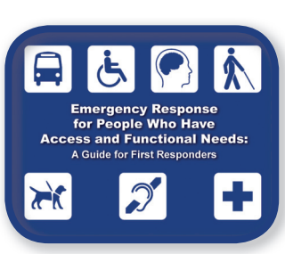
Flip book cover

Note: The content of this flip book and companion DVD can also be found at <a href="http://terrorism.spcollege.edu">http://terrorism.spcollege.edu</a>.