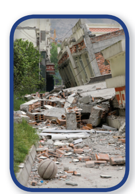
Residential street after earthquake